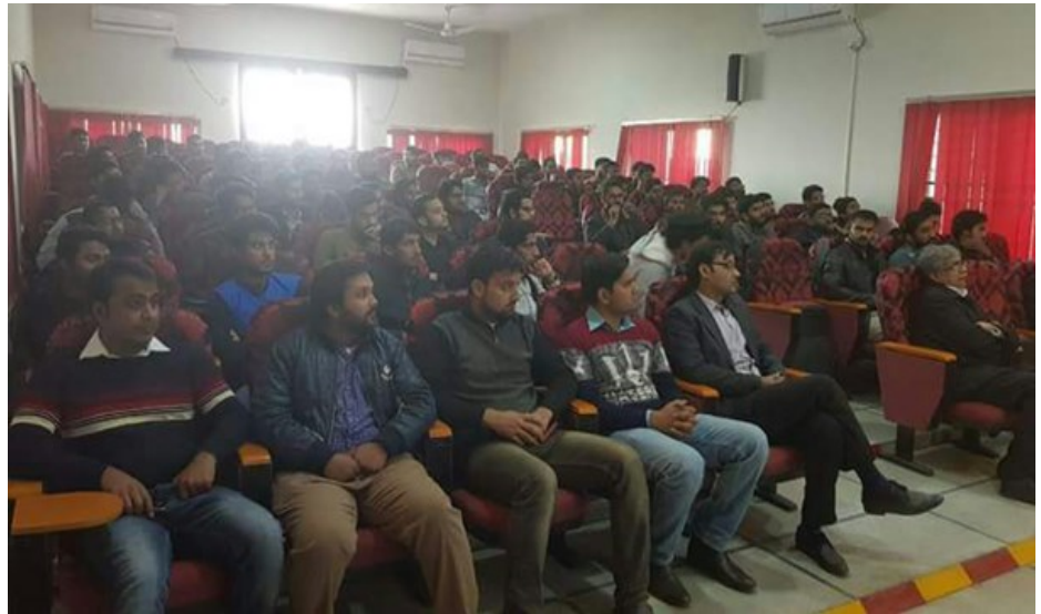
ASHRAE UCEST student Branch, LAHORE organized an industrial visit to Bulley Shah Packages industry to explore the industrial knowledge on Jan 28, 2018